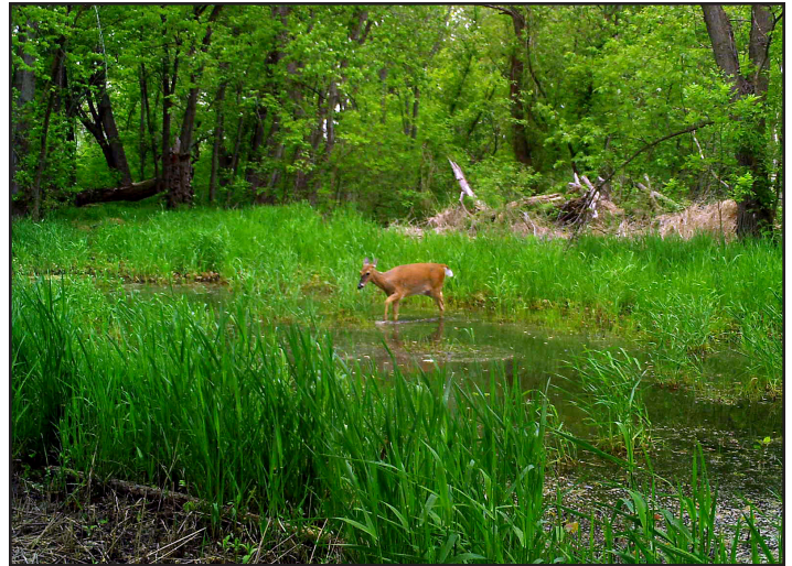
A white-tailed deer walks through the Neumiller Woods property.

Weather permitting, the project will begin at the end of April or early May and be completed by the end of June, if the weather cooperates.