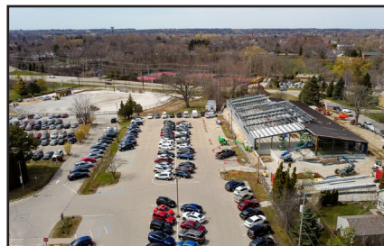
Carthage College Maintenance Building