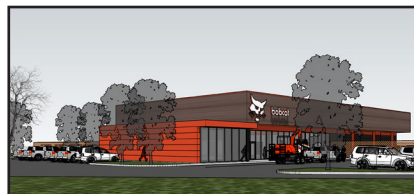
Bobcat Plus dealership