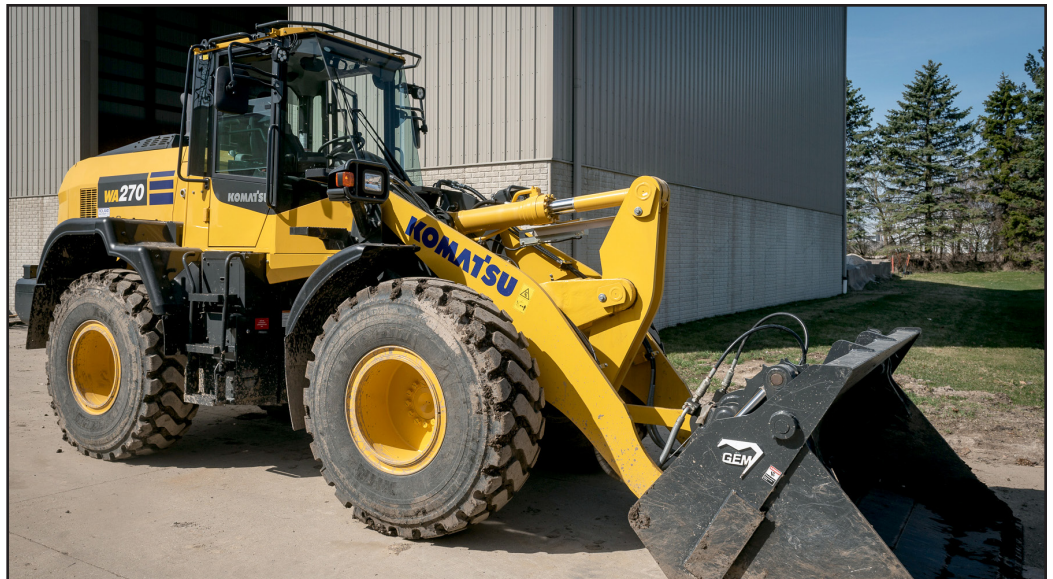
The Somers Public Works department took delivery of the front-end loader in March.

This was ordered as a part of the 2022 CIP. It replaced a 2003 vehicle at a cost of $50,169.