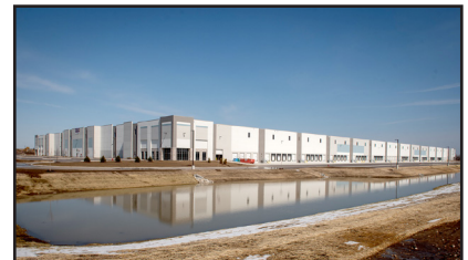
Somers Logistics Center