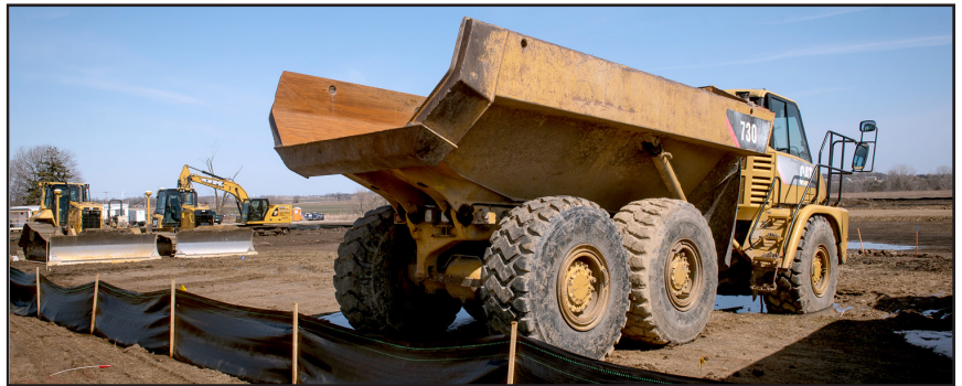
Mission 94 Firearms Education Center

■ Flint 94 — The first building in the Somers/Paris growth area at the southeast corner of Highway E and West Frontage Road is expected to be completed in May, the second in August.