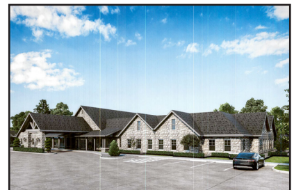
Home Inspired II