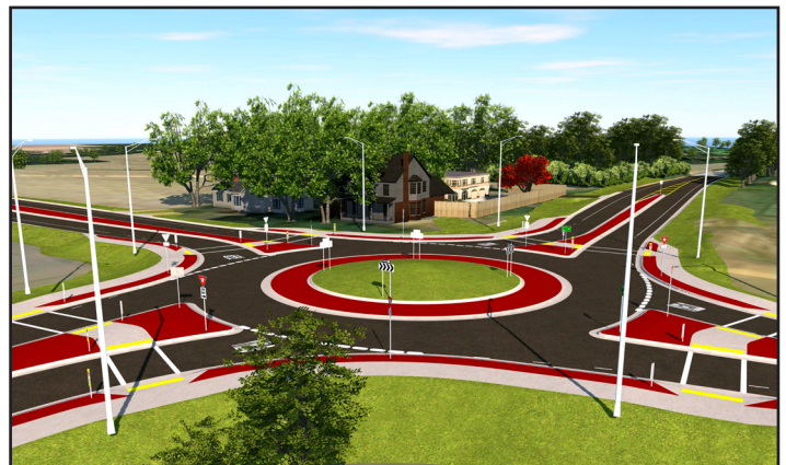
Rendering of the roundabout courtesy of Kenosha County and R.A. Smith, Inc.

More details, including a map of the project area and detour routes, are available on the Kenosha County website at