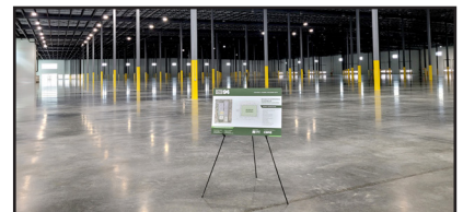
First Park 94