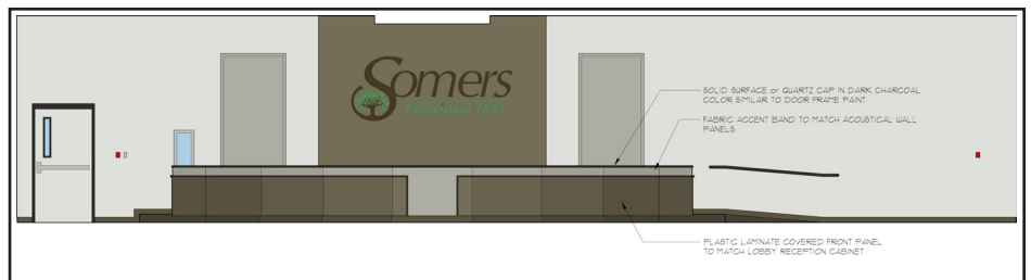
Architect rendering of the new Village/Town auditorium and desk