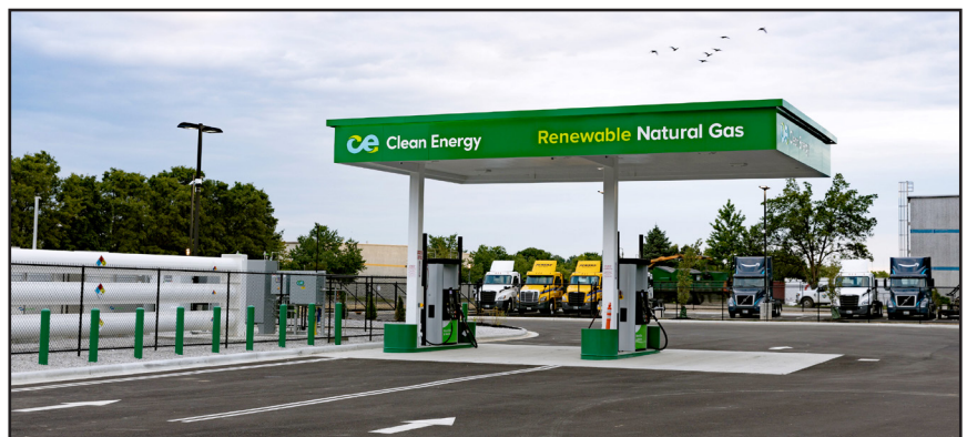
Compressed natural gas filling station