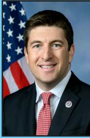
U.S. Rep. Bryan Steil

The office hours are intended to help residents with issues pending in Congress or to request assistance dealing with federal agencies.