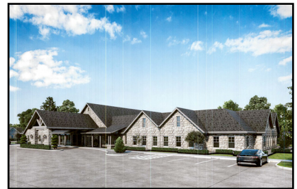
Home Inspired II