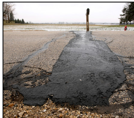
Somers Public Works department fixed several cracks on 100th Avenue with a new filler.

The department will monitor the new product and if it is found to hold up to the cold and plowing, the next 4.5 miles of the road will be repaired in the same fashion.