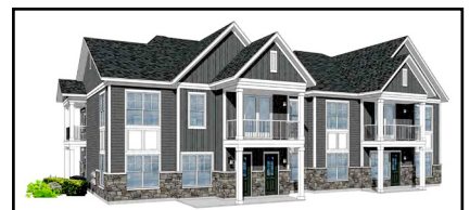
Hawthorn Apartments Phase II