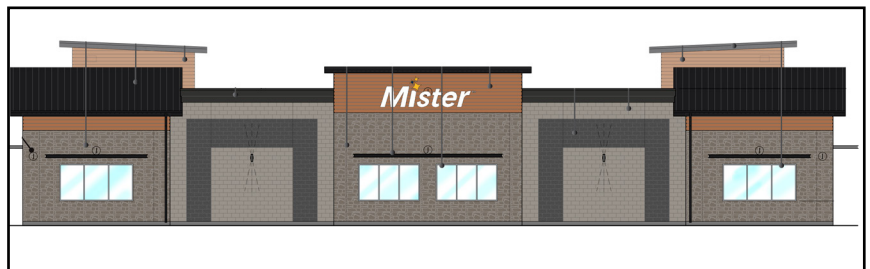
Architectural rendering of the Mister Car Wash building