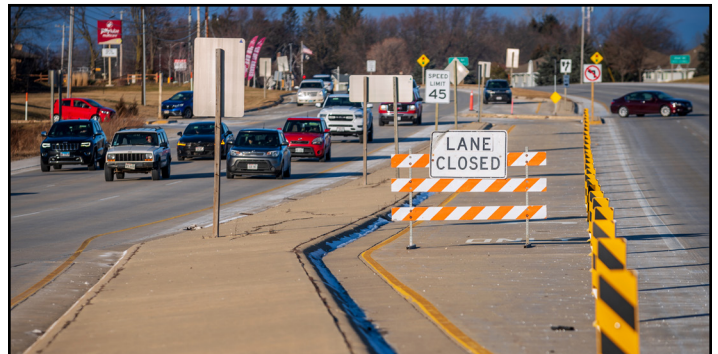
Signs have been posted since the turning lane was closed.

After a spate of fatal accidents involving vehicles turning west on 35th Street from the Green Bay Road turning lane, the Somers Village board passed a resolution on Jan. 25, 2022, for the Wisconsin Department of Transportation to review the traffic pattern.