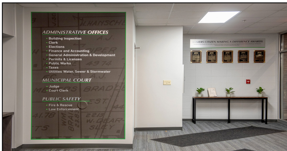
The "Making a Difference" award plaques are on display inside the newly remodeled Village/Town Hall Lobby.

Let a faucet run. A trickle the size of a pencil lead is all that is needed.