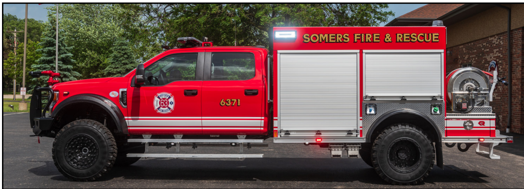
The Somers Fire and Rescue Department took delivery of its new Multi-hazard Emergency Response Vehicle.

The Somers Fire and Rescue Department just took delivery of a Multi-hazard Emergency Response Vehicle (MERV). The rig is built by Rosenbauer Fire Apparatus on a 2022 Ford F550 chassis at a cost of $224,928. It will feature a 300-gallon water tank, a 250-gallon-per-minute pump, carry 10 gallons of foam and be able to transport five firefighters inside the cab.