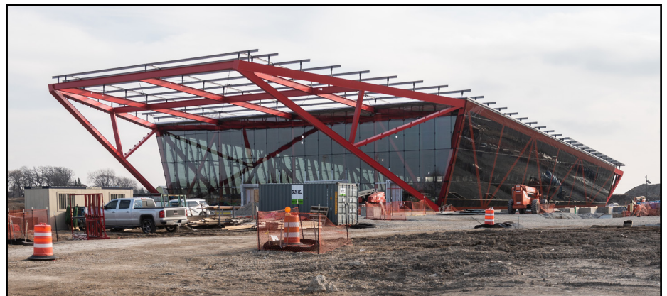
The Pritzker Archives & Memorial Park Center building is now fully enclosed with specially designed glass panes. A solar array reducing the buildings electrical consumption has been installed.