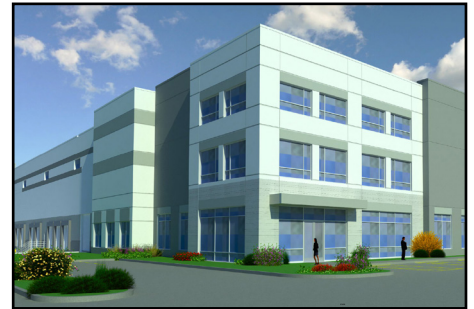
HSA Commercial development to be potentially named Somers Highland Commerce Center.