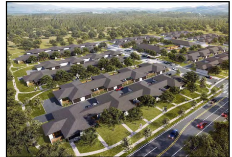
Rendering of the proposed Savanna at Pike Creek development.