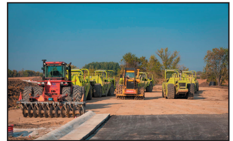
The Kwik Trip construction site