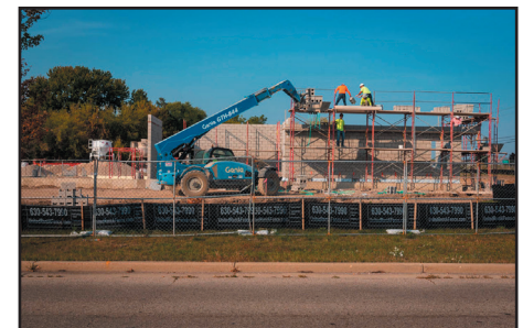
The Dunkin' Donuts site