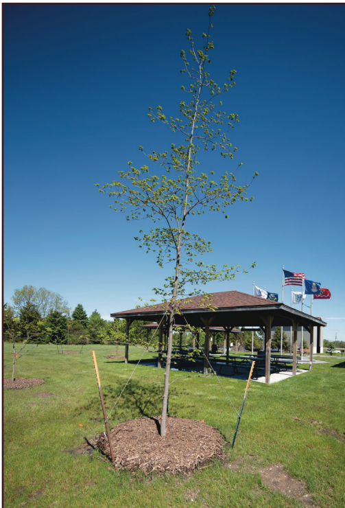
Rescued trees were planted around the Somers Veterans Memorial behind the Village/Town Hall.

The Village and Town of Somers are participating in the 2019 Wisconsin DNR Urban Forestry Grant. Somers received the grant in 2018 and 2016. This year the grant amounts to just over $20,000 and reimburses work done to promote sustainable urban and community forestry. The grant reimburses up to 50 percent of the cost of qualifying work done throughout the year.