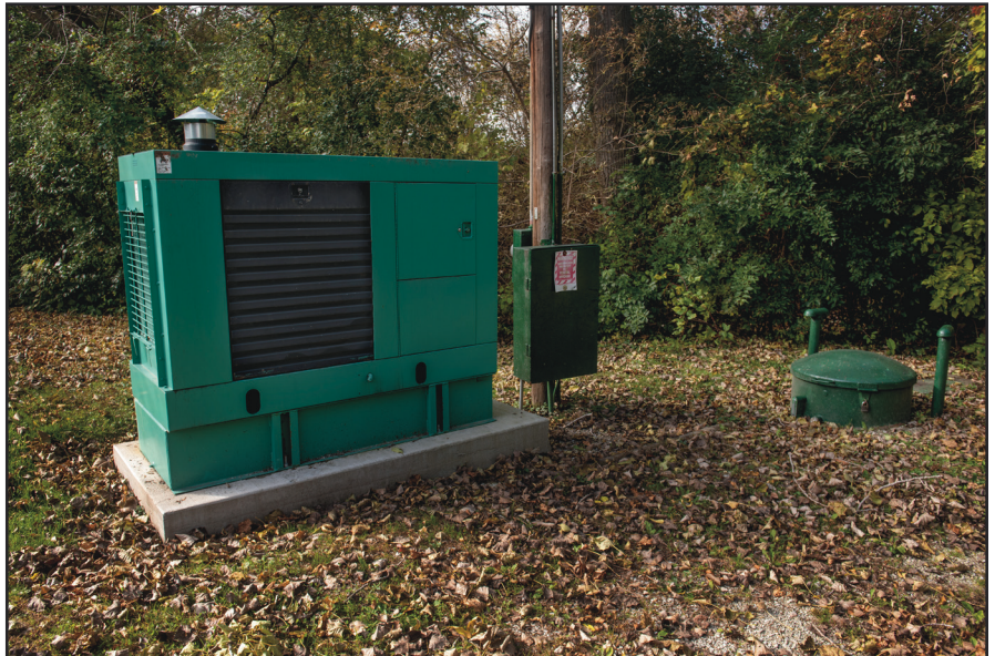
The lift station at the end of 11th Place is scheduled for upgrade.

The lift stations in that area were installed in the early 1960s and after more than 50 years of service, have reached the end of their life expectancy.