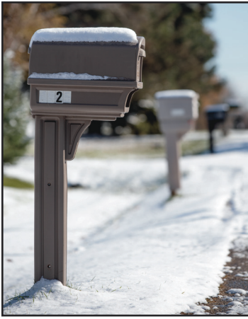
Numbers are missing from this mailbox.