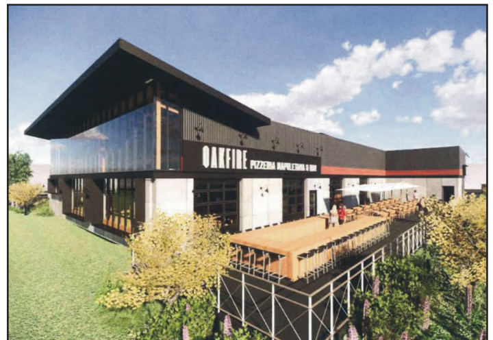
A rendering of the new Oakfire restaurant shows its outdoor eating area.

The Somers restaurant will be about 10,000 sq. ft., with an outdoor eating area and have parking for 134 vehicles.