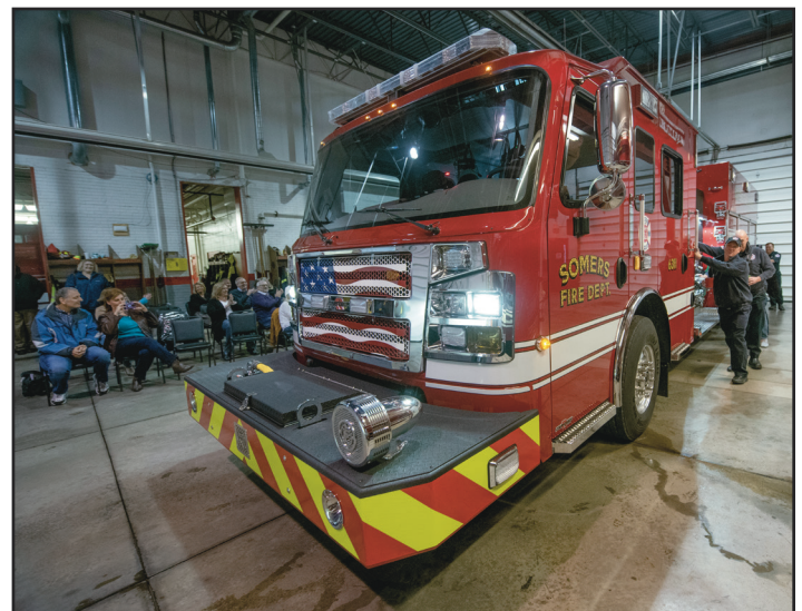
Somers Firefighters push the new fire engine in Station 1's the bay in front of people gathered for the dedication ceremony Nov. 17, 2019.

The Fire Department is also purchasing a new ambulance