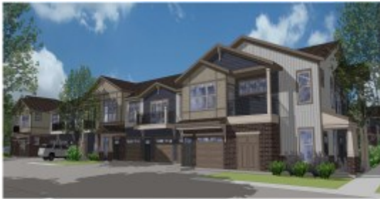
JLA SOMERS MULTI-FAMILY 20 Unit - Front View 29 SEPT 2015