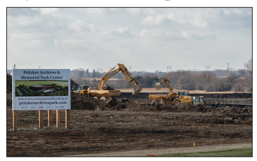
Heavy equipment grades the site of the Pritzker Archives and Memorial Park Center.

Less than 7 percent of the total 288 acres will feature buildings, the