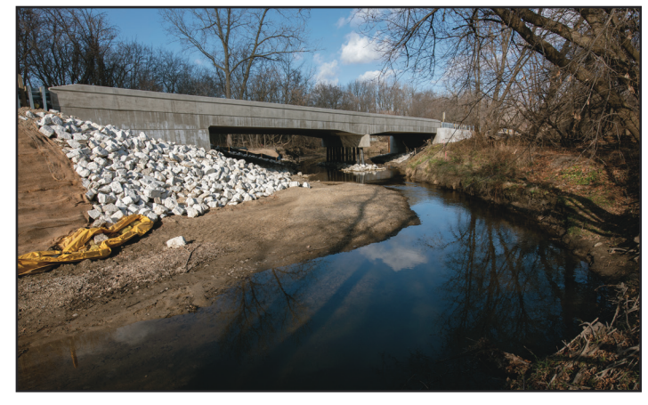
The 13th Avenue bridge over the Pike River has been repaired.

The infrastructure of the Town and Village continues to be upgraded. Here are some of this year's highlights: