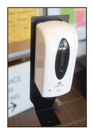
Sanitizing stations are available to visitors at the entrance of the Village/Town Hall.

The Village and Town incurred unplanned expenses due to the COVID-19 pandemic for personal protective equipment, sanitizers, disinfectant, sanitizing stations and other public safety products.