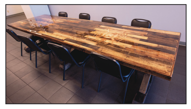
The new table is now at Station 1.

"Having these on the tabletop makes it more than a place to set down stuff," said San Juan. "It reminds us of