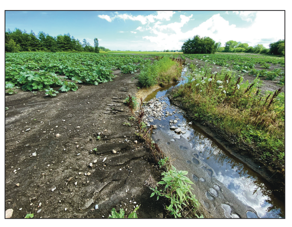
Farmland without vegetated buffers of 15 feet or more creates excessive erosion, runoff pollutants and flooding issues. Here, along a small tributary to the Somers Branch, Root-Pike WIN is working with the farmer to install wider stream buffers and consider cover crops and no-till techniques.

areas in Gitzlaff Park and Neumiller Woods in the Village of Somers to reduce flooding along the Somers branch