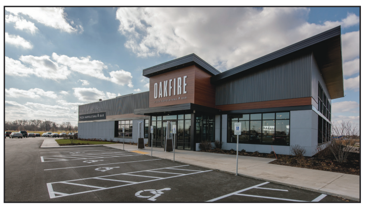
The Lake Geneva-based Oakfire Pizzeria Napoletana is open.

Construction of Metz Machines at 3700 72nd Ave. is nearly complete.